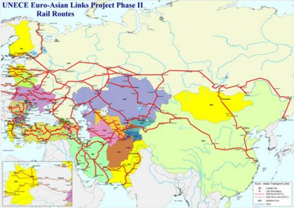
Figure 1: Scheme of EATL rail routes